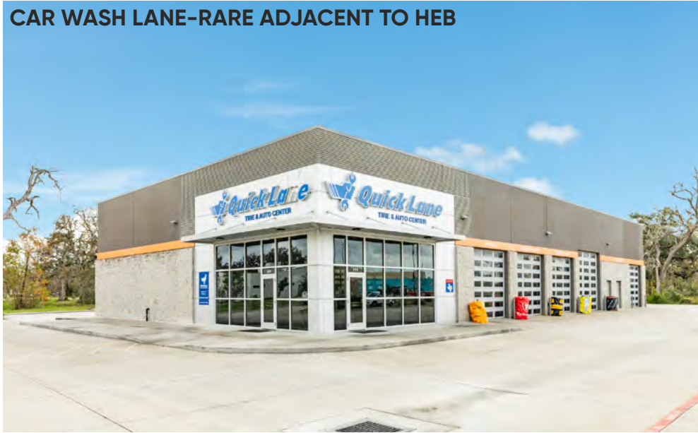
CAR WASH LANE-RARE ADJACENT TO HEB