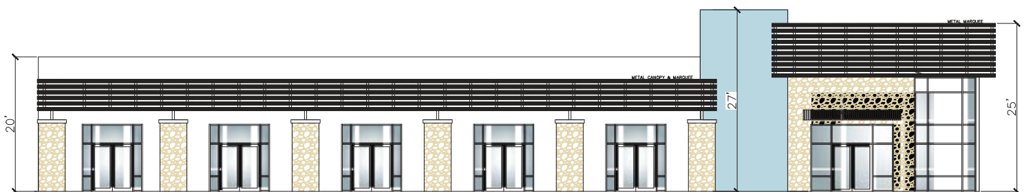
FRONT ELEVATION PLAN