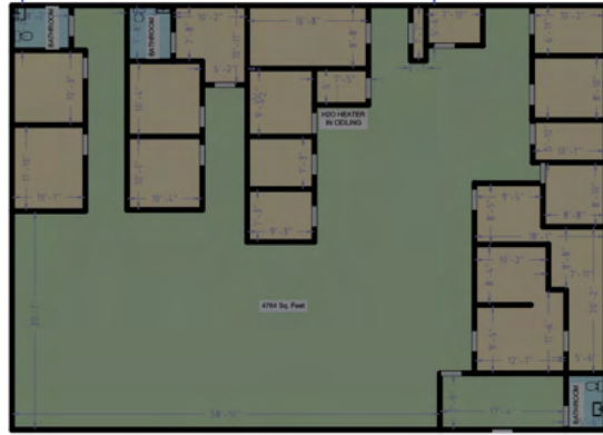
SPINE REHAB 6358 EDGEMERE BLVD, EL PASO, TX 79925