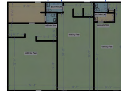
VICENTE BARBER 6306 EDGEMERE BLVD, EL PASO, TX 79925