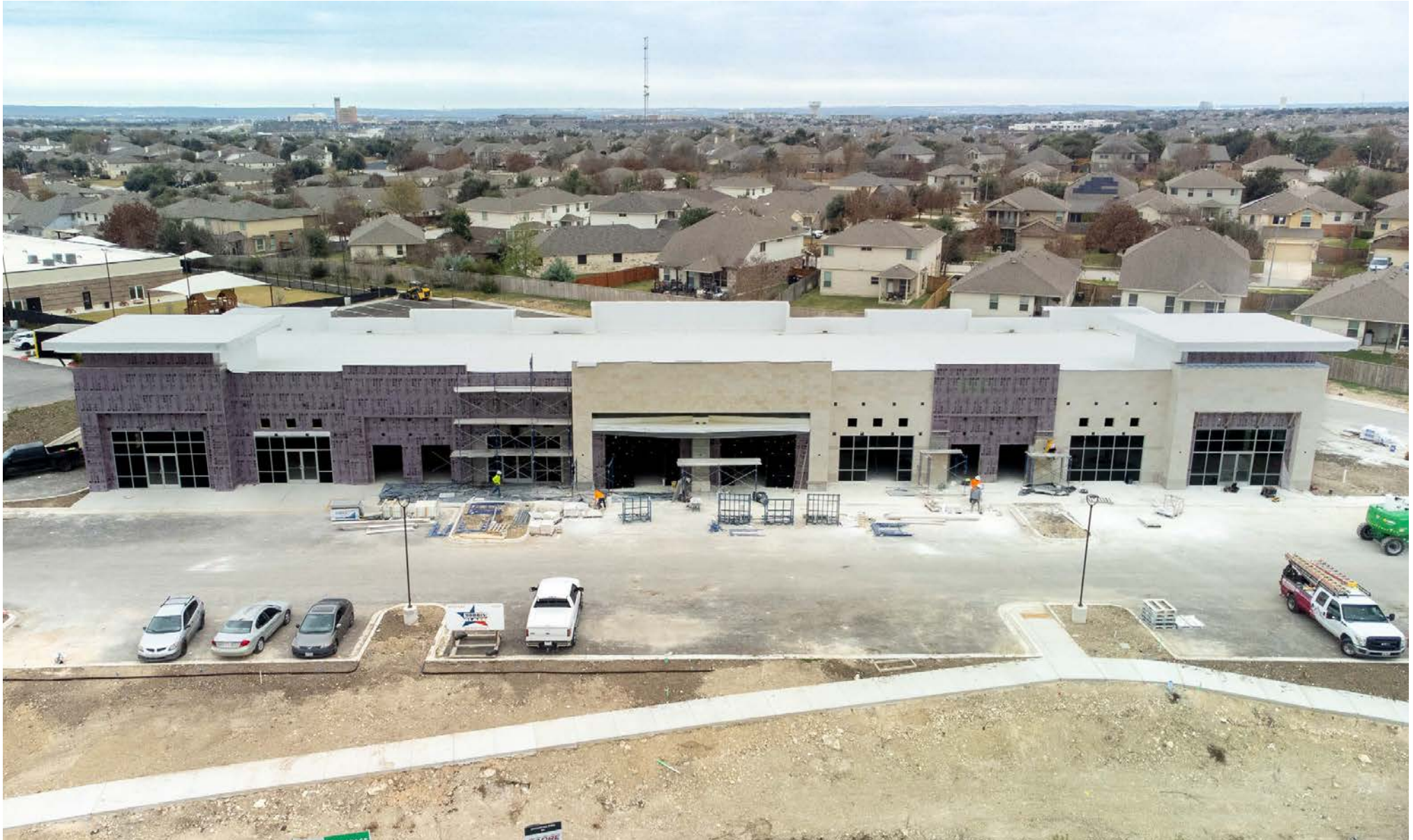
CONSTRUCTION PROGRESS JAN 2025