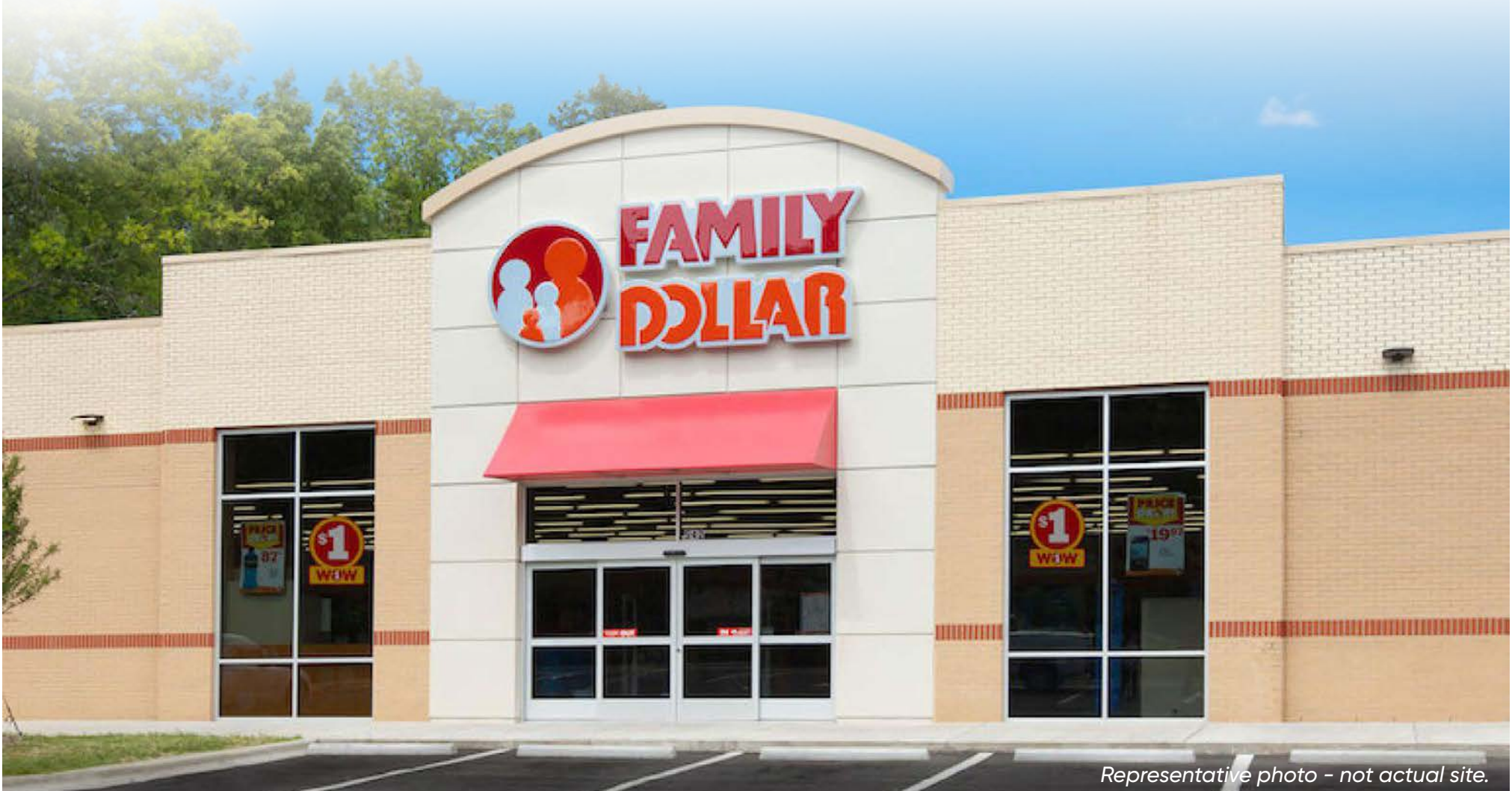
Representative photo - not actual site.

SE CORNER OF HIGHWAY 59 & HOOKS CEMETERY LOOK 6975 U.S. 69 Kountze, TX 77625