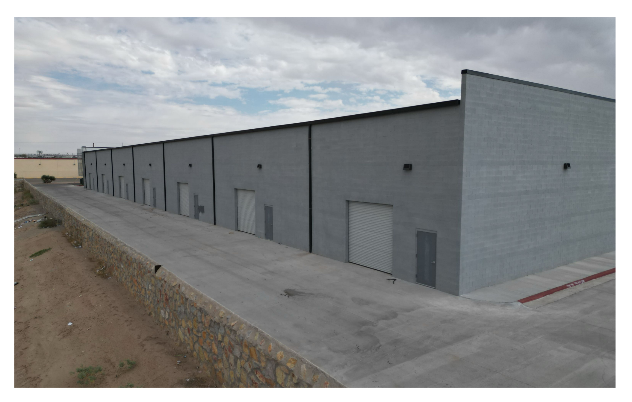
The information contained herein was obtained from sources deemed reliable; however, RESOLUT RE makes no guaranties, warranties or representations to the completeness or accuracy thereof. The presentation of this real estate information is subject to errors; omissions; change of price; prior sale or lease; or withdrawal without notice. RESOLUT RE, which provides real estate brokerage services, is a division of Reliance Retail, LLC, a Texas Limited Liability Company.