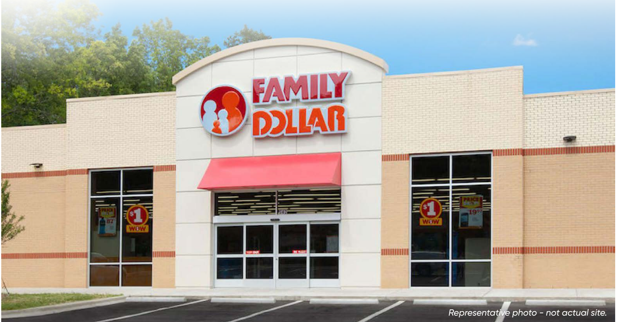
Representative photo - not actual site.

EAST SIDE OF N LAVACA AT THE INTERSECTION OF W MCKINNEY ST 300 North Lavaca Drive, Moulton, TX 77975