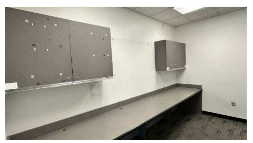
The information contained herein was obtained from sources deemed reliable; however, RESOLUT RE makes no guaranties, warranties or representations to the completeness or accuracy thereof. The presentation of this real estate information is subject to errors; omissions; change of price; prior sale or lease; or withdrawal without notice. RESOLUT RE, which provides real estate brokerage services, is a division of Reliance Retail, LLC, a Texas Limited Liability Company.