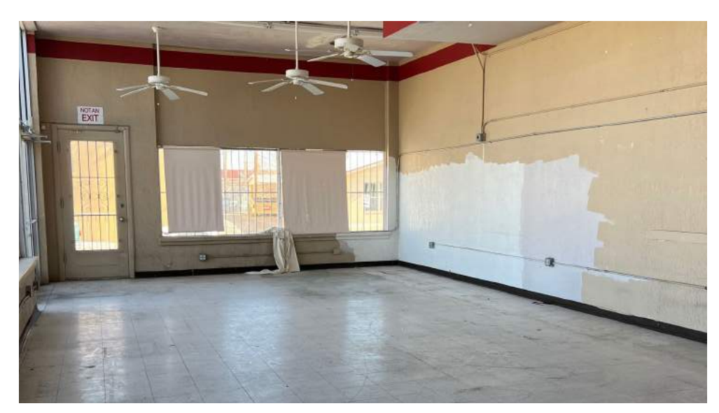
The information contained herein was obtained from sources deemed reliable; however, RESOLUT RE makes no guaranties, warranties or representations to the completeness or accuracy thereof. The presentation of this real estate information is subject to errors; omissions; change of price; prior sale or lease; or withdrawal without notice. RESOLUT RE, which provides real estate brokerage services, is a division of Reliance Retail, LLC, a Texas Limited Liability Company.