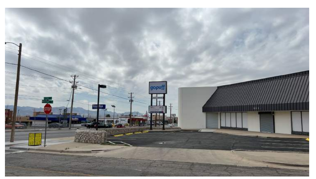
The information contained herein was obtained from sources deemed reliable; however, RESOLUT RE makes no guaranties, warranties or representations to the completeness or accuracy thereof. The presentation of this real estate information is subject to errors; omissions; change of price; prior sale or lease; or withdrawal without notice. RESOLUT RE, which provides real estate brokerage services, is a division of Reliance Retail, LLC, a Texas Limited Liability Company.