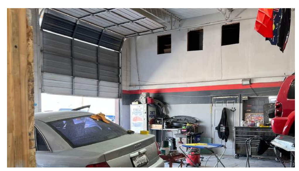
The information contained herein was obtained from sources deemed reliable; however, RESOLUT RE makes no guaranties, warranties or representations to the completeness or accuracy thereof. The presentation of this real estate information is subject to errors; omissions; change of price; prior sale or lease; or withdrawal without notice. RESOLUT RE, which provides real estate brokerage services, is a division of Reliance Retail, LLC, a Texas Limited Liability Company.