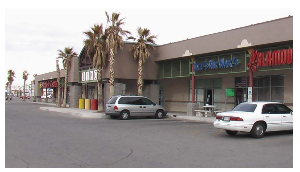
The information contained herein was obtained from sources deemed reliable; however, RESOLUT RE makes no guaranties, warranties or representations to the completeness or accuracy thereof. The presentation of this real estate information is subject to errors; omissions; change of price; prior sale or lease; or withdrawal without notice. RESOLUT RE, which provides real estate brokerage services, is a division of Reliance Retail, LLC, a Texas Limited Liability Company.