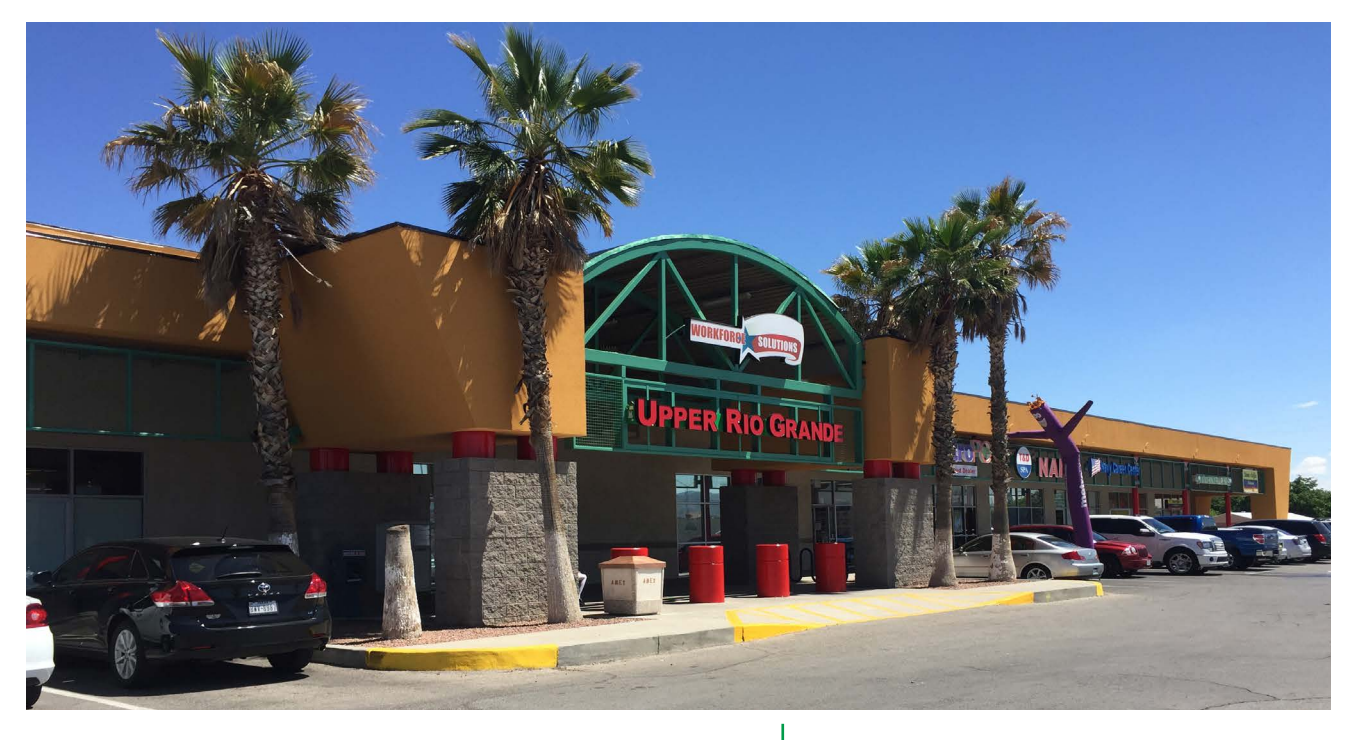
AREA TRAFFIC GENERATORS

Dyer Ave. is the busiest commercial corridor on the northeast part of El Paso. Fort Bliss is just a few minutes away through U.S. Highway and Transmountain Rd. which has impacted El Paso with the growth of the military population. Property is surrounded by residential and commercial developments.