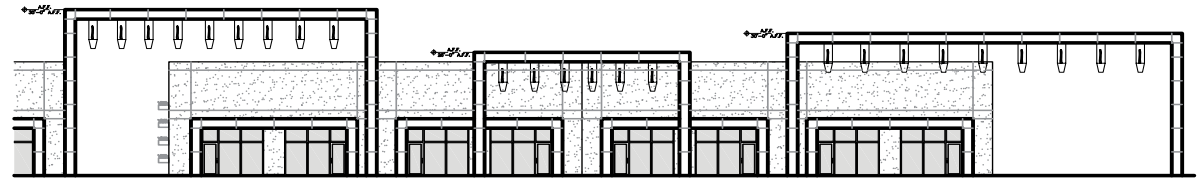
RETAIL NORTH ELEVATION SCALE: 1/8" = 1' - 0"