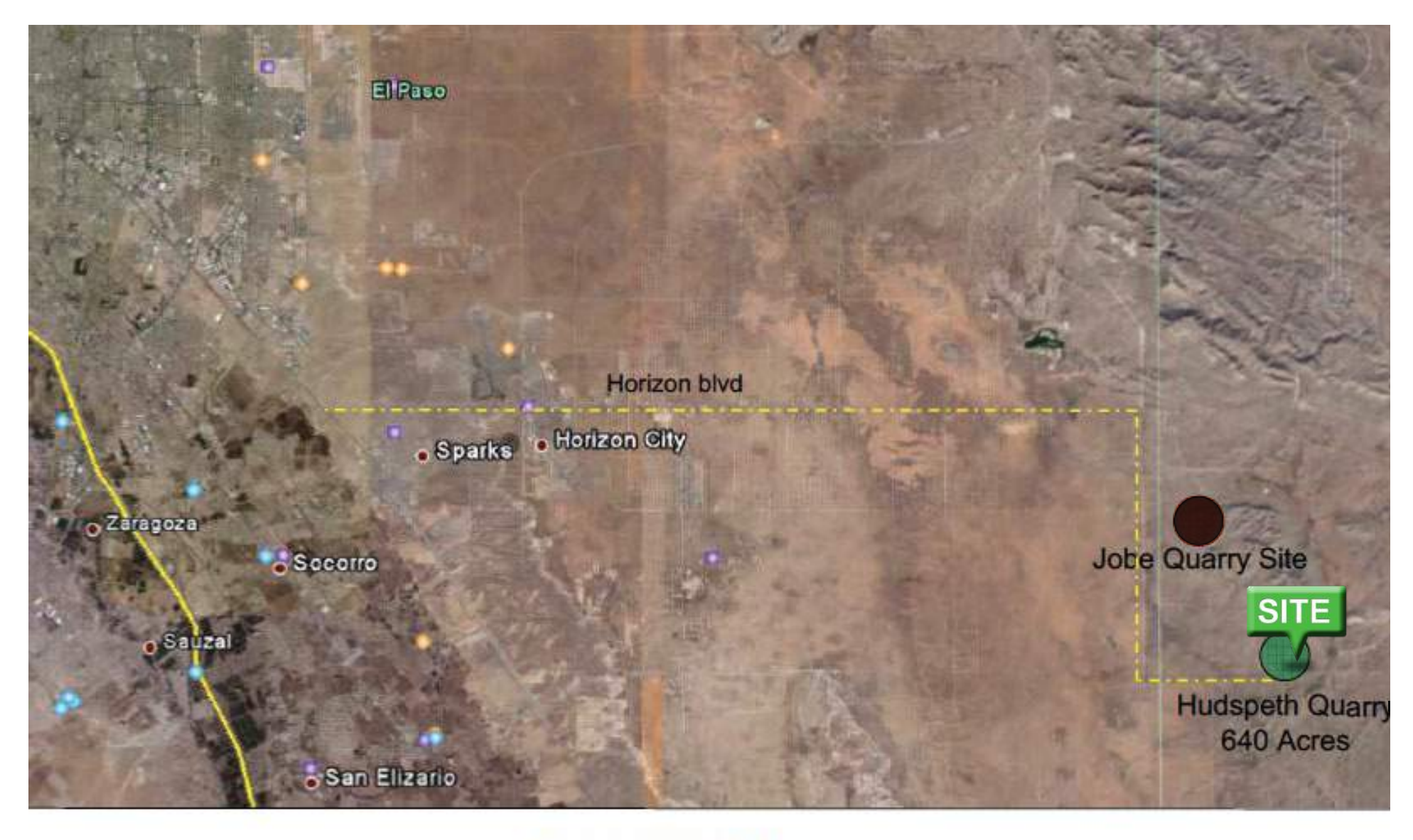
General Vicinity Map Hudspeth County Quarrry