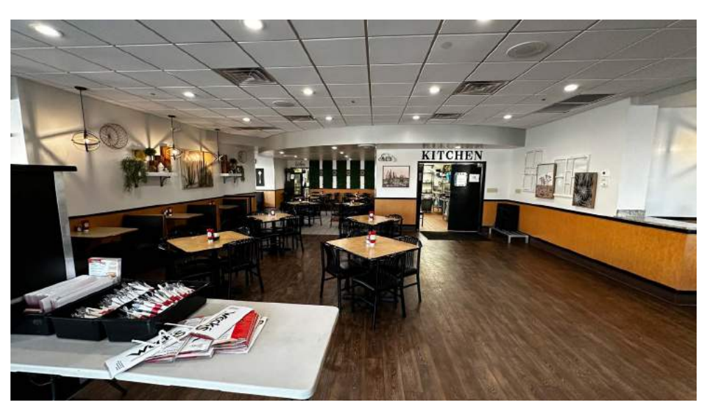
The information contained herein was obtained from sources deemed reliable; however, RESOLUT RE makes no guaranties, warranties or representations to the completeness or accuracy thereof. The presentation of this real estate information is subject to errors; omissions; change of price; prior sale or lease; or withdrawal without notice. RESOLUT RE, which provides real estate brokerage services, is a division of Reliance Retail, LLC, a Texas Limited Liability Company.