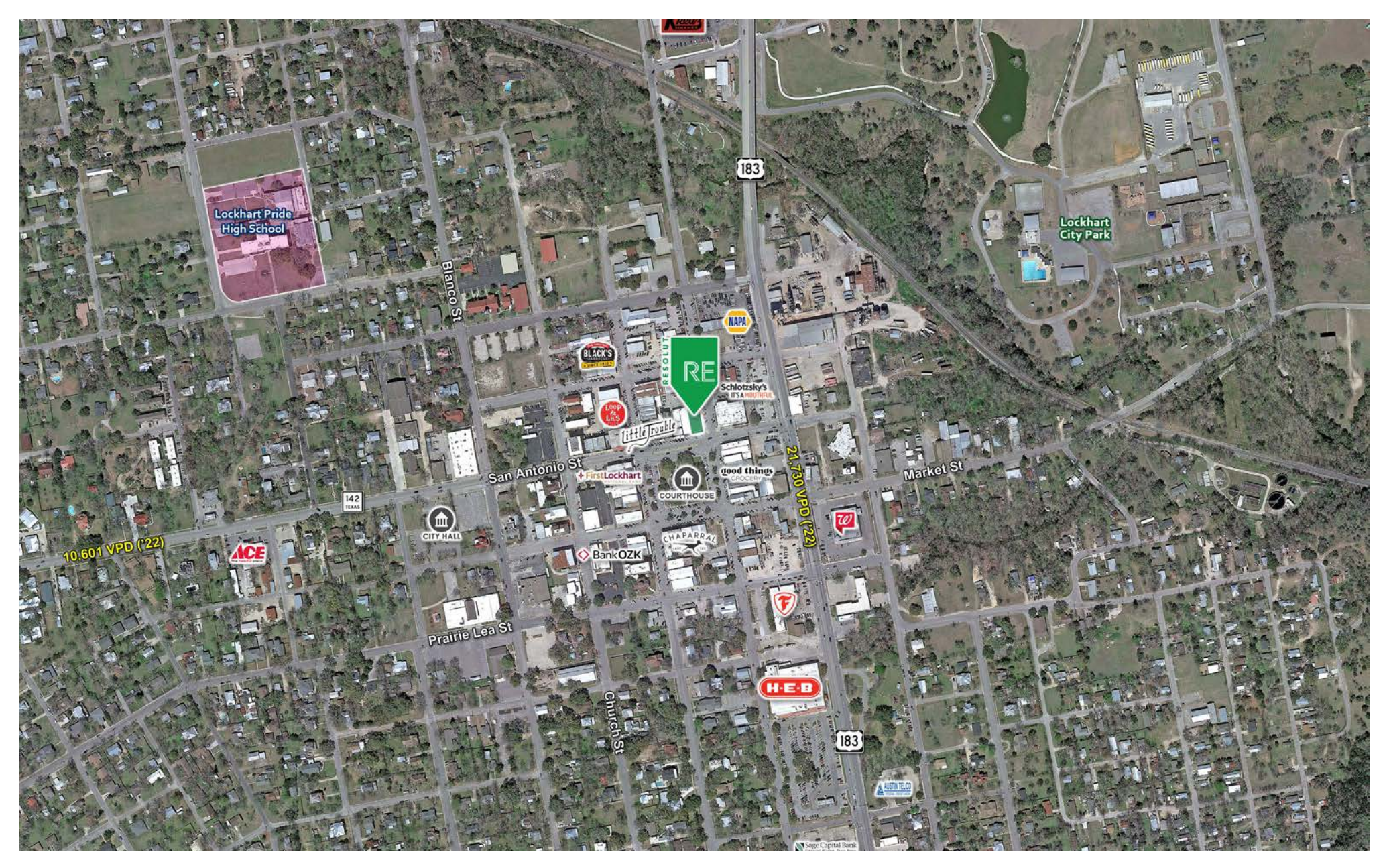
The information contained herein was obtained from sources deemed reliable; however, RESOLUT RE makes no guaranties, warranties or representations to the completeness or accuracy thereof. The presentation of this real estate information is subject to errors; omissions; change of price; prior sale or lease; or withdrawal without notice. RESOLUT RE, which provides real estate brokerage services, is a division of Reliance Retail, LLC, a Texas Limited Liability Company.