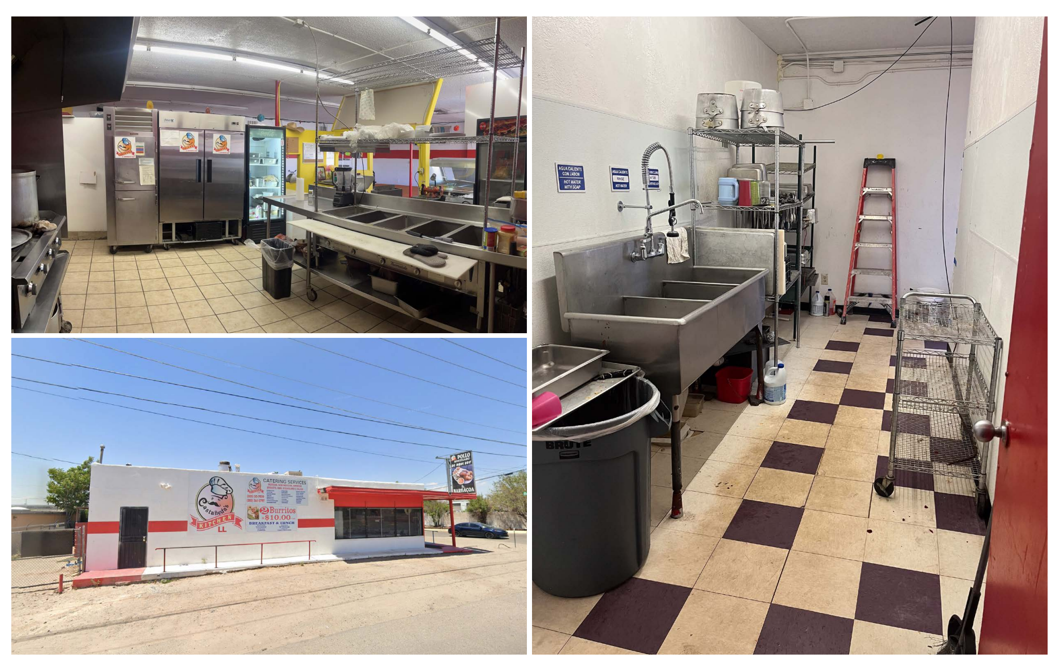
The information contained herein was obtained from sources deemed reliable; however, RESOLUT RE makes no guaranties, warranties or representations to the completeness or accuracy thereof. The presentation of this real estate information is subject to errors; omissions; change of price; prior sale or lease; or withdrawal without notice. RESOLUT RE, which provides real estate brokerage services, is a division of Reliance Retail, LLC, a Texas Limited Liability Company.