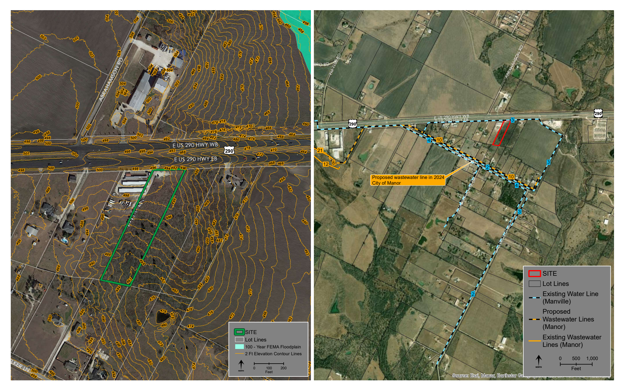
The information contained herein was obtained from sources deemed reliable; however, RESOLUT RE makes no guaranties, warranties or representations to the completeness or accuracy thereof. The presentation of this real estate information is subject to errors; omissions; change of price; prior sale or lease; or withdrawal without notice. RESOLUT RE, which provides real estate brokerage services, is a division of Reliance Retail, LLC, a Texas Limited Liability Company.