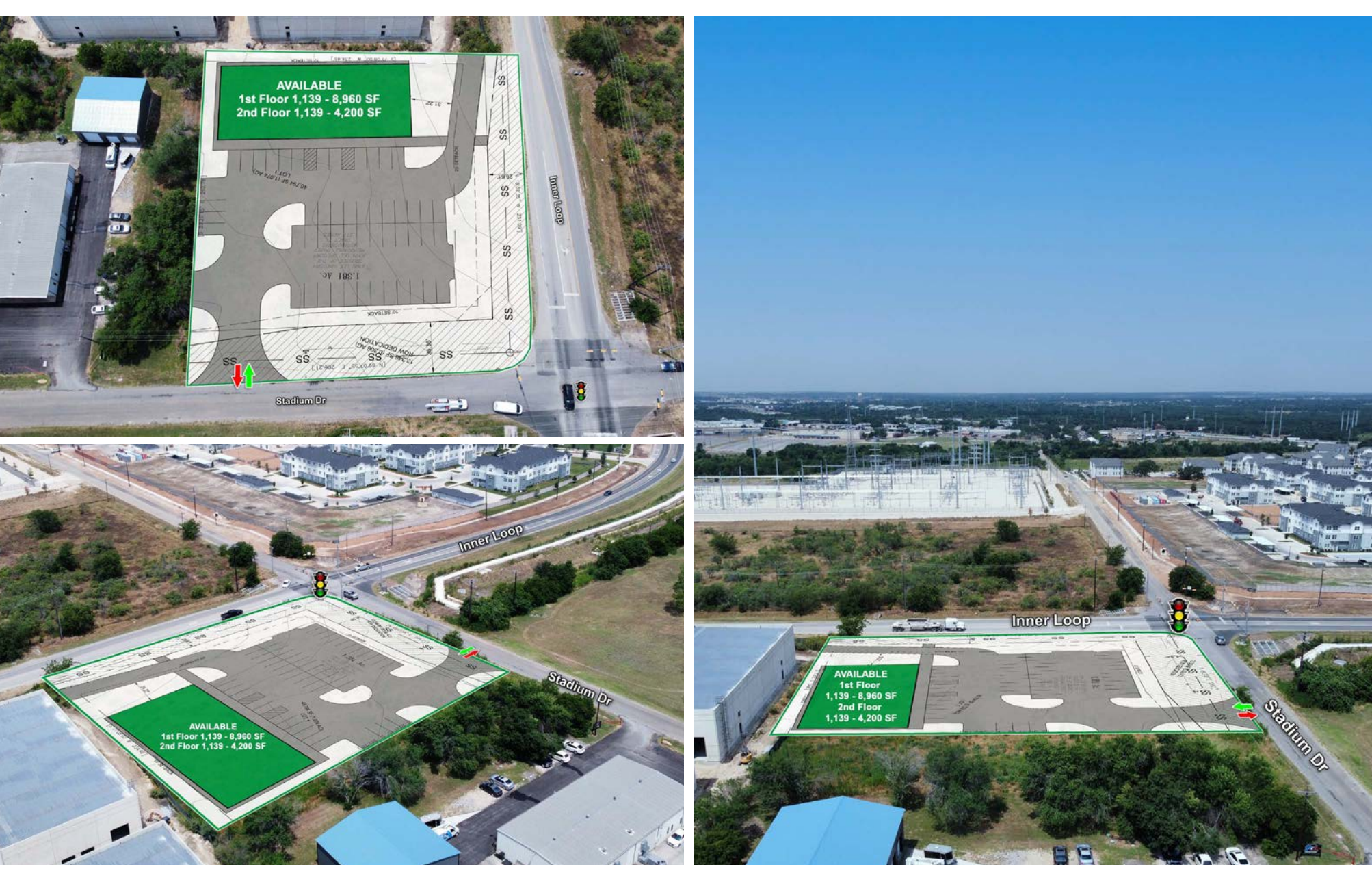
The information contained herein was obtained from sources deemed reliable; however, RESOLUT RE makes no guaranties, warranties or representations to the completeness or accuracy thereof. The presentation of this real estate information is subject to errors; omissions; change of price; prior sale or lease; or withdrawal without notice. RESOLUT RE, which provides real estate brokerage services, is a division of Reliance Retail, LLC, a Texas Limited Liability Company.