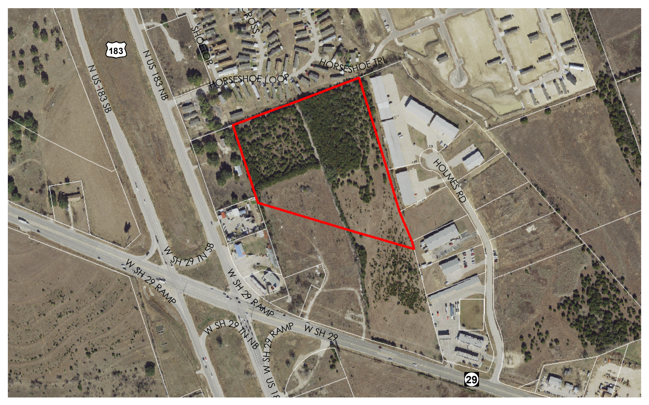
The information contained herein was obtained from sources deemed reliable; however, RESOLUT RE makes no guaranties, warranties or representations to the completeness or accuracy thereof. The presentation of this real estate information is subject to errors; omissions; change of price; prior sale or lease; or withdrawal without notice. RESOLUT RE, which provides real estate brokerage services, is a division of Reliance Retail, LLC, a Texas Limited Liability Company.