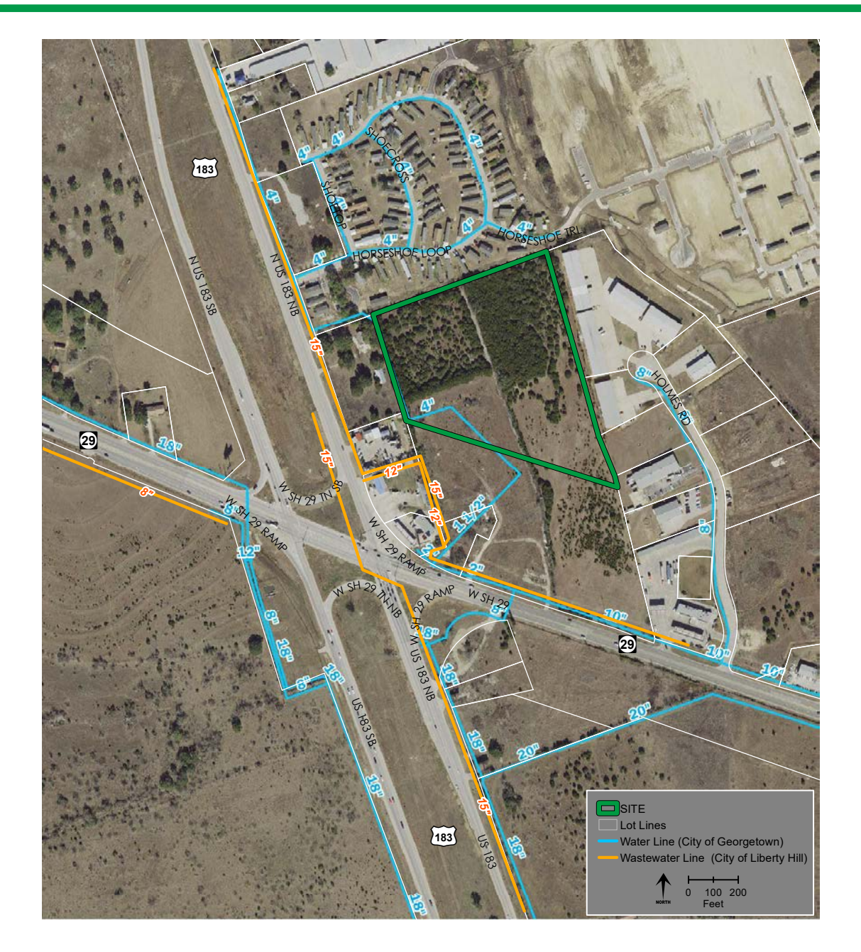
The information contained herein was obtained from sources deemed reliable; however, RESOLUT RE makes no guaranties, warranties or representations to the completeness or accuracy thereof. The presentation of this real estate information is subject to errors; omissions; change of price; prior sale or lease; or withdrawal without notice. RESOLUT RE, which provides real estate brokerage services, is a division of Reliance Retail, LLC, a Texas Limited Liability Company.