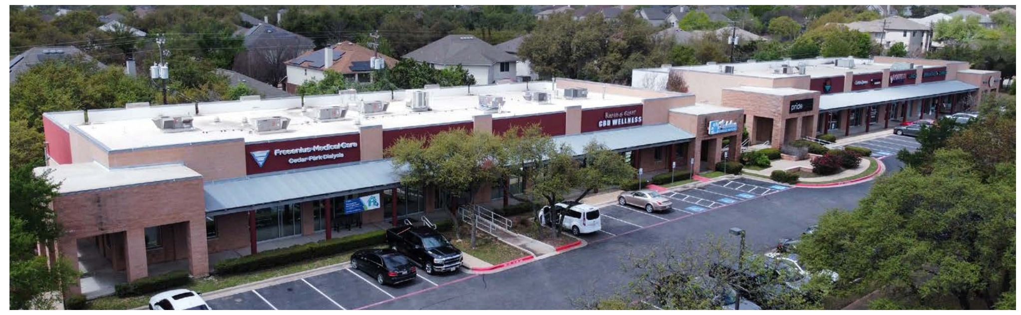
The information contained herein was obtained from sources deemed reliable; however, RESOLUT RE makes no guaranties, warranties or representations to the completeness or accuracy thereof. The presentation of this real estate information is subject to errors; omissions; change of price; prior sale or lease; or withdrawal without notice. RESOLUT RE, which provides real estate brokerage services, is a division of Reliance Retail, LLC, a Texas Limited Liability Company.