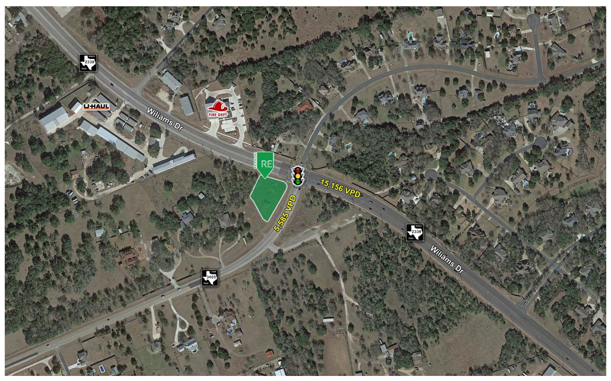
The information contained herein was obtained from sources deemed reliable; however, RESOLUT RE makes no guaranties, warranties or representations to the completeness or accuracy thereof. The presentation of this real estate information is subject to errors; omissions; change of price; prior sale or lease; or withdrawal without notice. RESOLUT RE, which provides real estate brokerage services, is a division of Reliance Retail, LLC, a Texas Limited Liability Company.