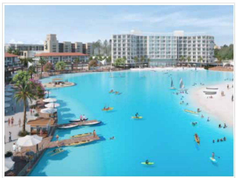
The Austin area is getting a crystal lagoon. Courtesy rendering

massive new development is underway in the Austin area, promising retail, restaurants, entertainment, a hotel, office and residential space, and 4-acre crystalline lagoon.