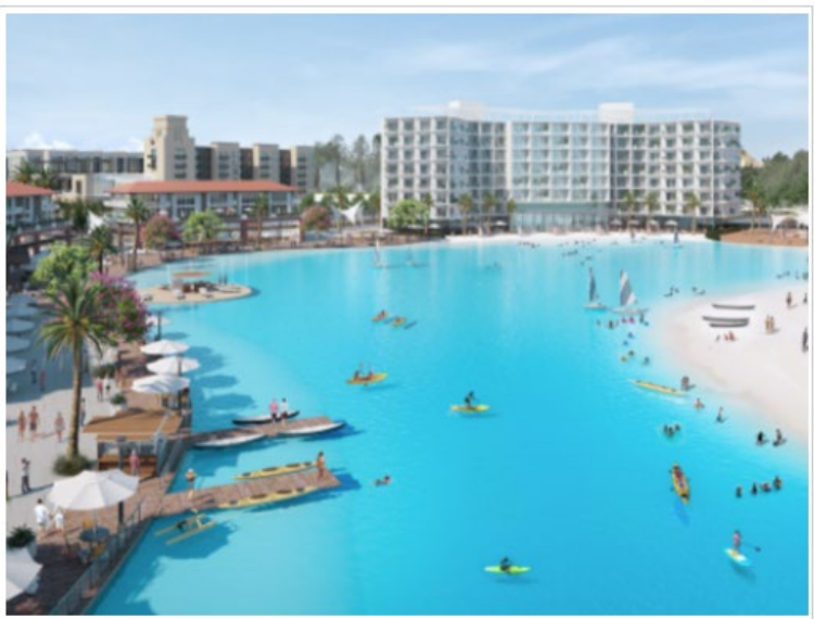
The Austin area is getting a crystal lagoon. Courtesy rendering

massive new development is underway in the Austin area, promising retail, restaurants, entertainment, a hotel, office and residential space, and 4-acre crystalline lagoon.