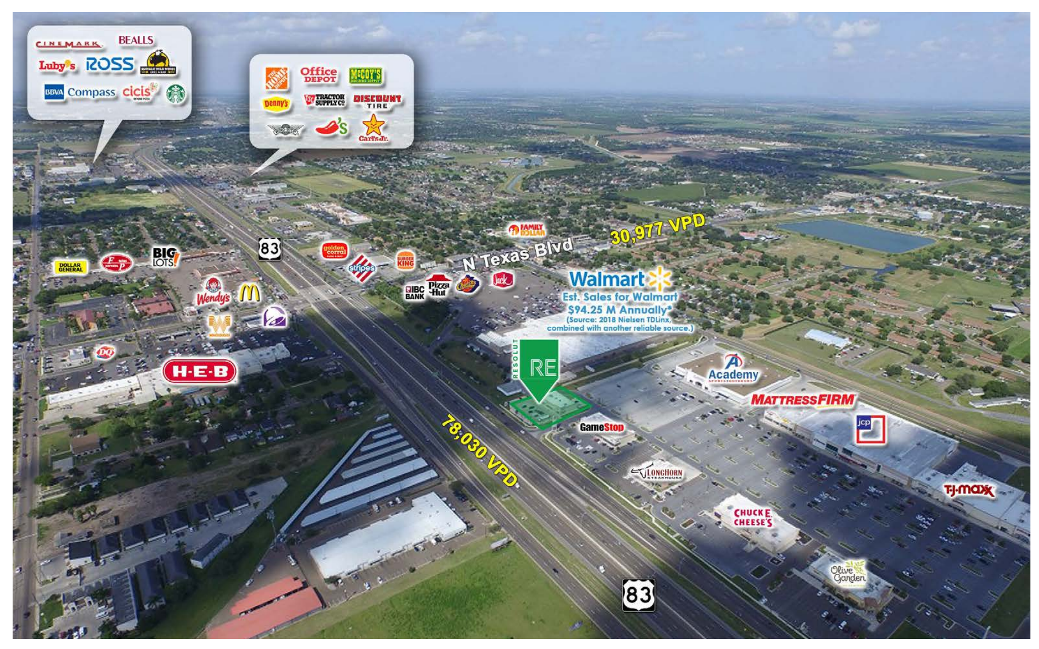
The information contained herein was obtained from sources deemed reliable; however, RESOLUT RE makes no guaranties, warranties or representations to the completeness or accuracy thereof. The presentation of this real estate information is subject to errors; omissions; change of price; prior sale or lease; or withdrawal without notice. RESOLUT RE, which provides real estate brokerage services, is a division of Reliance Retail, LLC, a Texas Limited Liability Company.