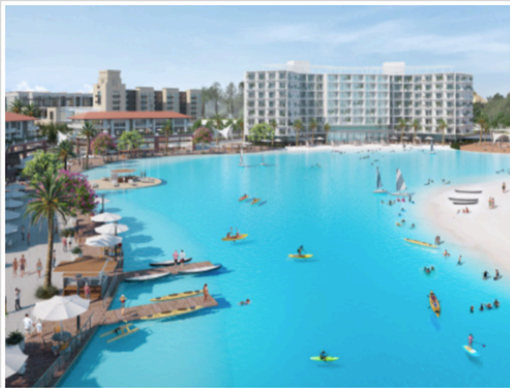
The Austin area is getting a crystal lagoon.

A massive new development is underway in the Austin area, promising retail, restaurants, entertainment, a hotel, office and residential space, and 4-acre crystalline lagoon.